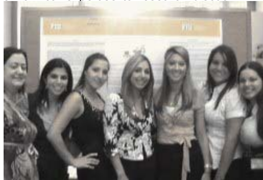
FIU OT students

On April 6, Region 7 hosted the first annual Region 7 Research Symposium at Nova University. Over 25 posters were displayed by OT graduate students from Barry, FIU and Nova. Clinicians had the opportunity to learn about research projects our students are involved with and the chance to add their clinical expertise to research discussions.